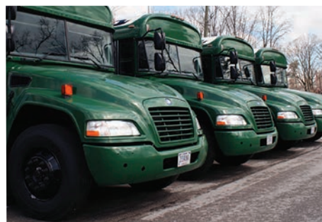
The Kentucky Clean Cities Partnership coalition worked with Mammoth Cave National Park to put new propane buses into service for visitor tours. Read more about this and other successful projects at afdc.energy.gov/case .

Light-, medium-, and heavy-duty propane vehicles are available for various applications. Propane vehicles are either dedicated or bi-fuel. Buyers can purchase vehicles through OEM dealerships or have existing in-service vehicles converted to propane (see next section).