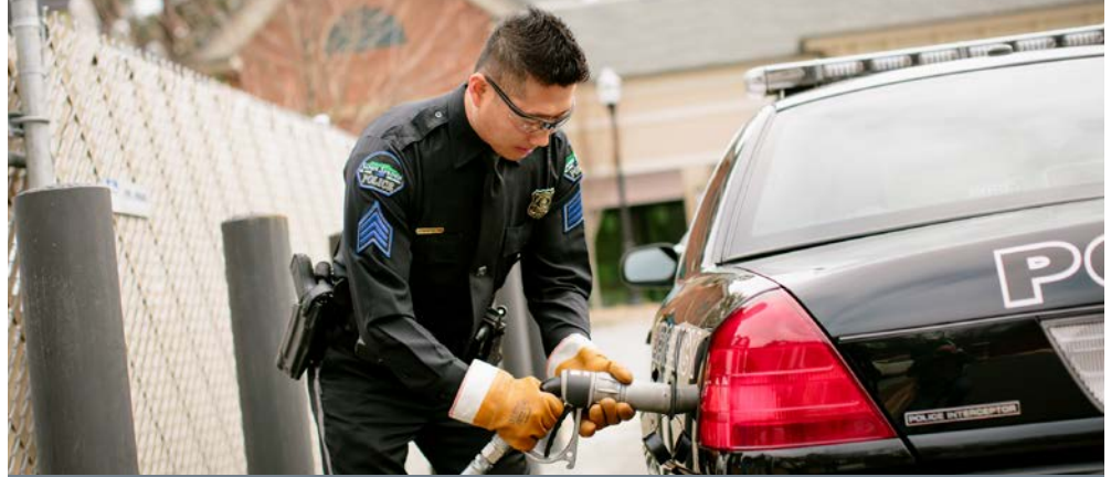
An officer from the Sandy Springs Police Department in Georgia refuels a converted Crown Victoria cruiser. The Sandy Springs fleet has operated on propane 96% of the time since 2011.

Just like conventional vehicles, propane vehicles must comply with all applicable regulations, including Federal Motor Vehicle Safety Standards (FMVSS). Compared to gasoline and diesel, however, propane has a higher autoignition