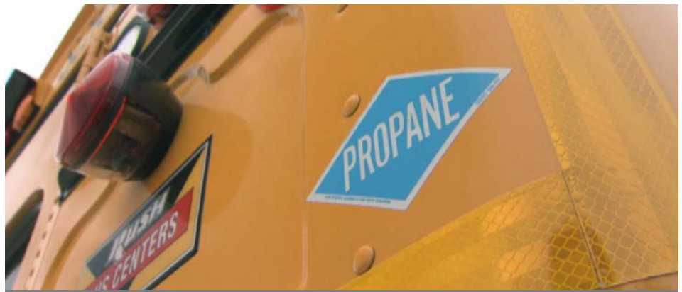
Lower maintenance costs are a prime reason behind propane’s popularity for high-use vehicles, such as school buses.

Propane fueling infrastructure is very similar to that of gasoline and diesel. The fuel is stored onsite, typically in aboveground tanks ranging from 1,000 to 30,000 gallons. 7